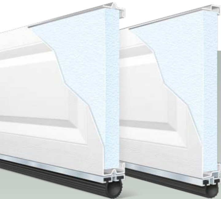
Tongue-and-Groove Section Joints

Improve your home's appearance and energy efficiency with a Clopay Value Plus insulated garage door. Available in 24 or 25 gauge steel with 1-5/16" polystyrene insulation, Value Plus models offer moderate insulating R-values, strength and security, as well as quiet operation and a beautiful appearance. Choose from two panel styles, many color options and a wide range of window options to create a door that fits your budget and enhances your home's curb appeal.